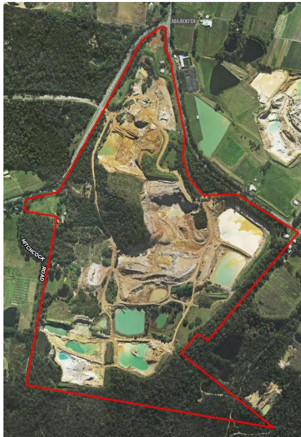
Figure 1. Hitchcock Road Sand Project Site Area

Refer to Figure 1 below for the project site extraction area.