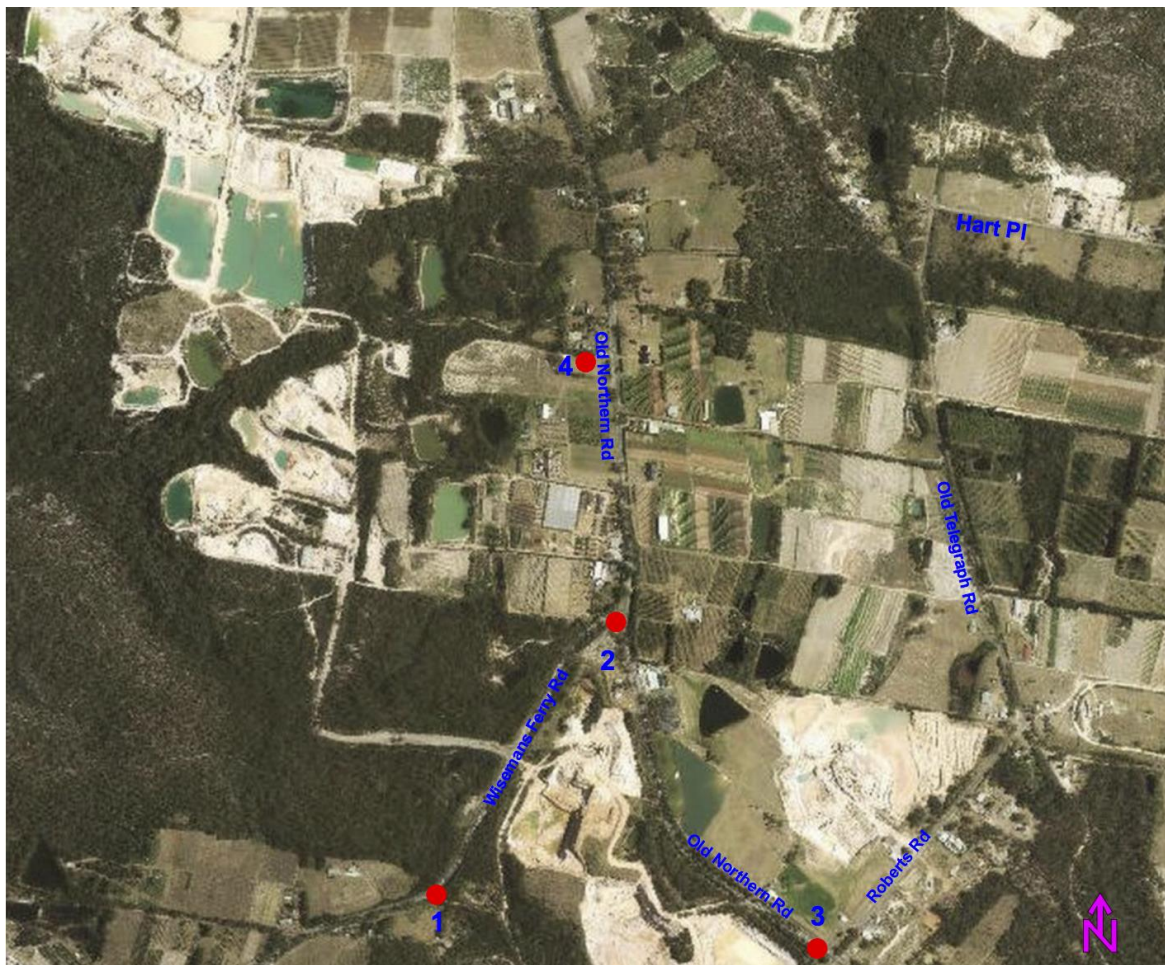
Figure 9.1 Noise impact Assessment Monitoring Locations